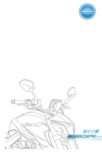
① ZT350-R通用说明书*1 3040301-043700