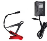
③ ZT350胶体电池充电器*1 1184300-026000