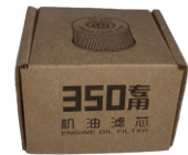
⑧ ZT184MP精滤密封组件 (纸盒包装)*1 4134300-001000