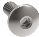
⑪ 非标螺栓M6×12 (304不锈钢)*2 1251100-101000