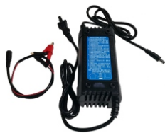
⑱ ZT310铅酸电池充电器*1 1184200-105000