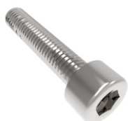
⑨ GB70.1M6×30 (不锈钢) *4 1250205-031091