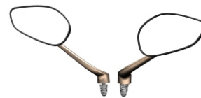
④ ZT310-VX后视镜*1 1190100-407000