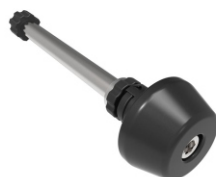
⑭ ZT250-R平衡块*1 1134200-023000