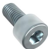
⑩ GB70.1. 内六角螺栓M8×16 (环保彩锌) *4 1250205-040095