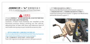
② ZT310-V脚踏安装卡*1 3040302-020700