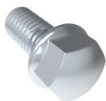
㉙ GB16674M6×12*2 (镀铬/HH) 1250104-006097