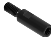
⑫ ZT310-V后刹主泵活塞推杆加长杆*1 1274200-170000