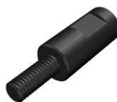
⑲ ZT310前挡泥板衬套 (黑锌)*2 1274200-035194