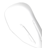
㉘ ZT310-VX挡风玻璃*1 1224200-188000