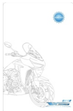
① ZT310-VX通用说明书*1 3040301-034600