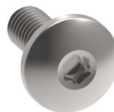
⑪ 非标螺栓M6×12 (304不锈钢) *2 1251100-101000