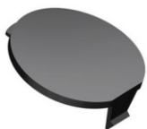
㉑ ZT310-V后尾裙前小盖 (深灰哑光)*2 4044201-257051