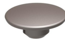
⑯ ZT250-SM8螺栓装饰扣*4 1224100-025000