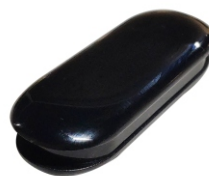
⑦ ZT310 感应钥匙总成 (手环版) *2 1184200-142000