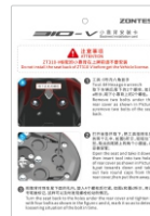
③ ZT310-V后靠背安装说明书*1 3040301-023900