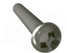
⑬ 十字球头螺丝M5×30*1 1251100-219000