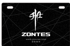
⑰ 后广告牌 (ZONTES升仕) *1 1210201-362000