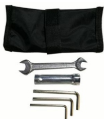
⑤ ZT310-R随车工具*1 1274200-078000