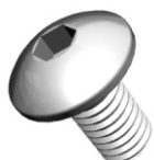
⑨ 非标螺栓M6×12*2 (304不锈钢) 1251100-101000