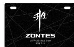
⑯ 后广告牌(ZONTES升仕)*1 1210201-362000