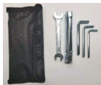
⑰ ZT310T-M随车工具*1 1276200-041000