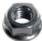
⑩ GB6177.1M6(环保彩)*2 1250303-010093