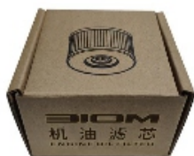
⑤ ZT1P72MN精滤密封组件 (纸盒包装)*1 4136200-013000