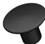
⑪ ZT310T-M后扶手尾箱安装孔装饰扣*4 1246200-024000