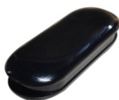
⑭ ZT310感应钥匙(手环版)*2 1184200-092000