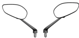
② ZT310-VX后视镜*1 (深灰) 1190100-407051