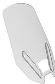
⑦ ZT310T-M挡风玻璃*1 (升级版) 1226400-003000