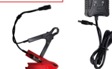
⑫ ZT350胶体电池充电器*1 1184300-026000